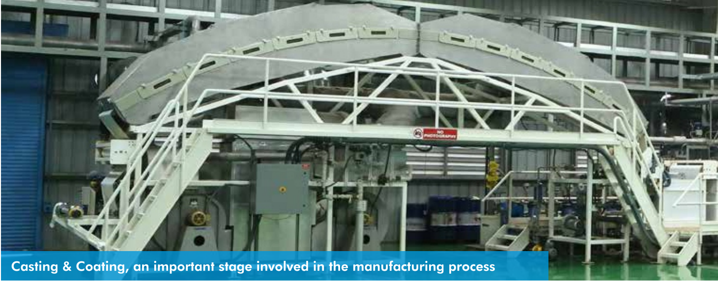
Casting & Coating, an important stage involved in the manufacturing process